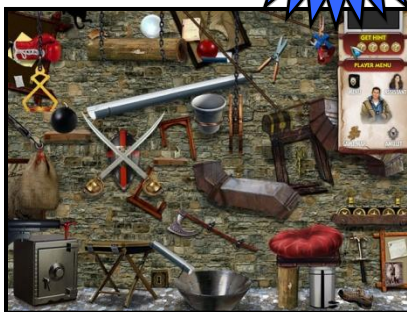
Between The Worlds