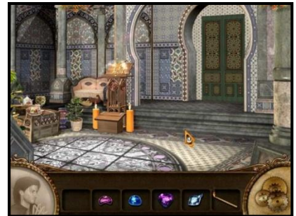
Dominic Crane 2: Dark Mystery Revealed