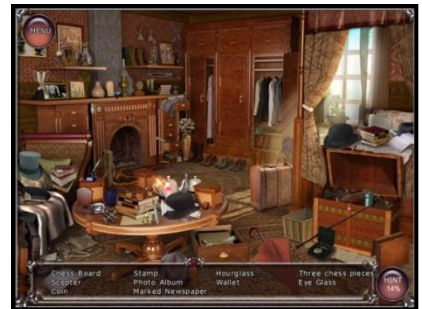
Epic Adventures: La Jangada