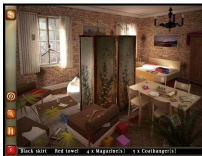
Hd0: Girl in the City